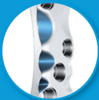
Innovative Plate Design