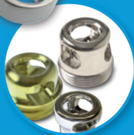
Cable Fixation Options